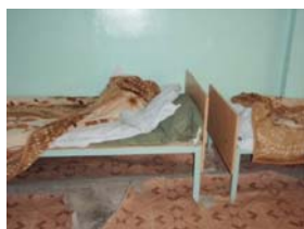
Bed and floor needing attention.

Yet there is hope. Things are changing. The director borrowed $1,000 from a friend to purchase paint. Six rooms have been painted – by the men. They are waiting to get more paint and then to fix the floors. More rooms need painted – and they will need more resources to do this.