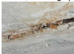
On the ceiling – fungi and mold – plus a leaky ceiling.

to the men. We took lots of tangerines and breakfast buns to them and the director wanted to show us his needs and what he has accomplished. He has the men painting rooms, cleaning up things and doing the best he can getting things in order. It is a very sad sight. They have mold and other fungi growing on the walls, the ceilings and in each of the rooms. The floors are broken. They have only a few spoons, not enough plates/bowls for each of the men to eat. The dining room furniture is unsteady and not enough for everyone to sit at the same time. Chairs and tables are falling apart. The home is full of lice. The men have one sheet and one blanket on their bed. They have no washing machine, no dryer, and no hot water. To wash the bedding – it takes days for things to dry – leaving them without bedding until it is dry. It is damp and cold inside.