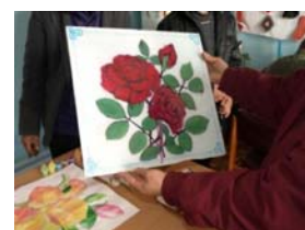
The art - it could be sold to bring hope and dignity to many!